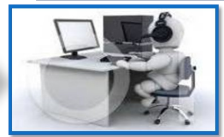
Remote Notary Public